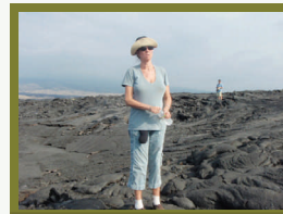
The Tempest (2010) Location Scouting Director Julie Taymor

are engaged in the production receive payments, in turn spending that money on other things down the food chain. The state of Hawai'i uses a very conservative multiplier effect of 1.6, so our 2 million in direct production spending is the actual equivalent of 3.2 million of total economic impact.