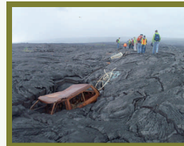
Lava Flow Areas Location Scouting

2) build our own local industry and capacity; and 3) build infrastructure and business, community, and government relationships to enable our promotion and capacity.